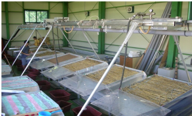
Fig. 1. Rainfall simulator and soil-box (runoff plot) placement.

The main experimental apparatus consisted of three components: runoff plot, rainfall simulator, and water supply and control system (Fig. 1). A runoff plot was a soil box of 1 \times 1 \times 0.5 m in size. Sixteen soil boxes were made of galvanized metal sheeting. Each box was equipped with two gutters, at the top and bottom, to collect surface and subsurface runoff, respectively. The boxes were filled with soil approximating the texture in alpine agricultural areas, and saturated with water for more than two months for natural compaction and to restore soil properties. The boxes were placed on 10% or 20% steel-framed bases before rainfall simulation tests. Ladder-type rainfall simulators developed by the United States Department of